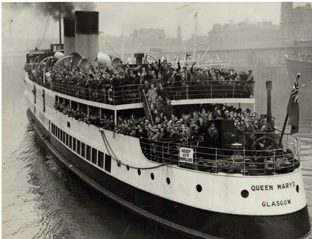
TS Queen Mary II built by William Denny and Brothers in 1933.

Support and contributions have been provided by staff and volunteers of the Ballast Trust and representatives of various organisations and archives including: the Archives and Records Association, the Business Archives Council of Scotland, Edinburgh City Archives, Glasgow City Archives, Glasgow Museums, National Records of Scotland, North Lanarkshire Archives, Project Class 22 Society, Scottish Borders Archive and Local History Centre, Scottish Maritime Museum, Timeline Films, Trustees of the Ballast Trust, University of Glasgow Archives and Special Collections.